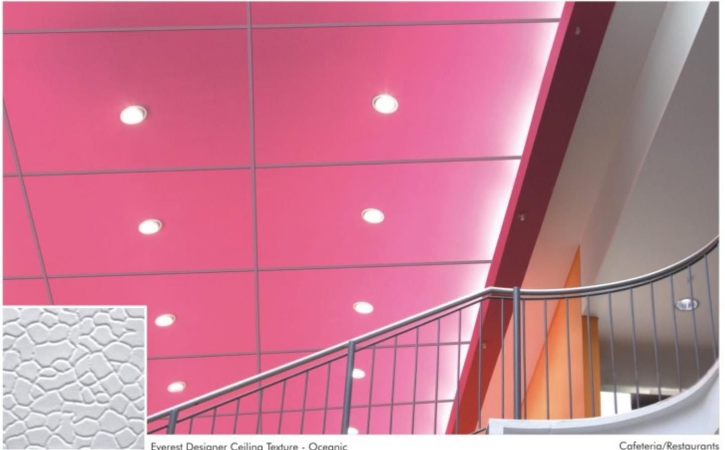
Everest Designer Ceiling Texture - Oceanic