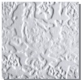
Lake & Hill